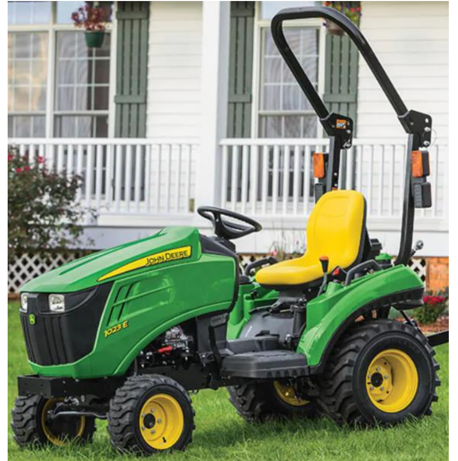
John Deere 1023E