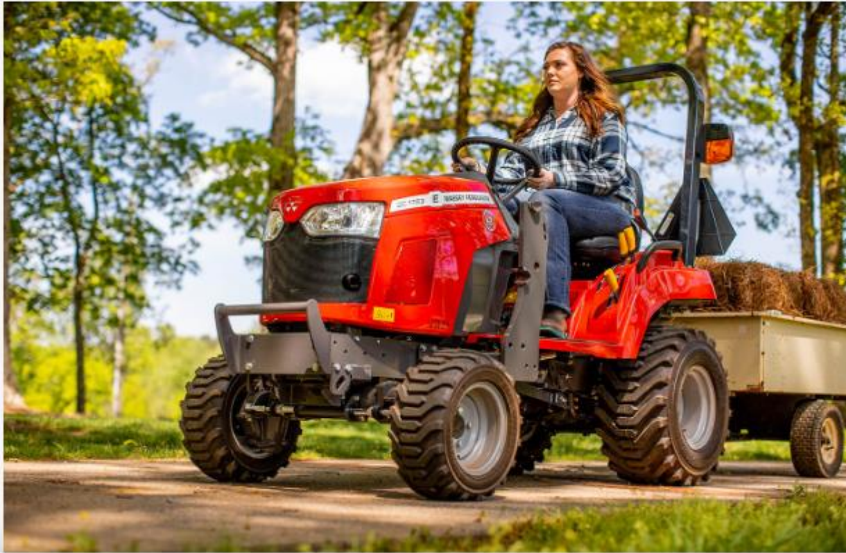
Massey Ferguson 1723E